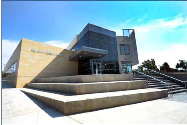
The new student health center, scheduled for completion in October, 2014.

The University's new student health center is scheduled for completion in October, 2014. The $10,200,000.00 project will provide a state-of-the art health care facility. Preparations began