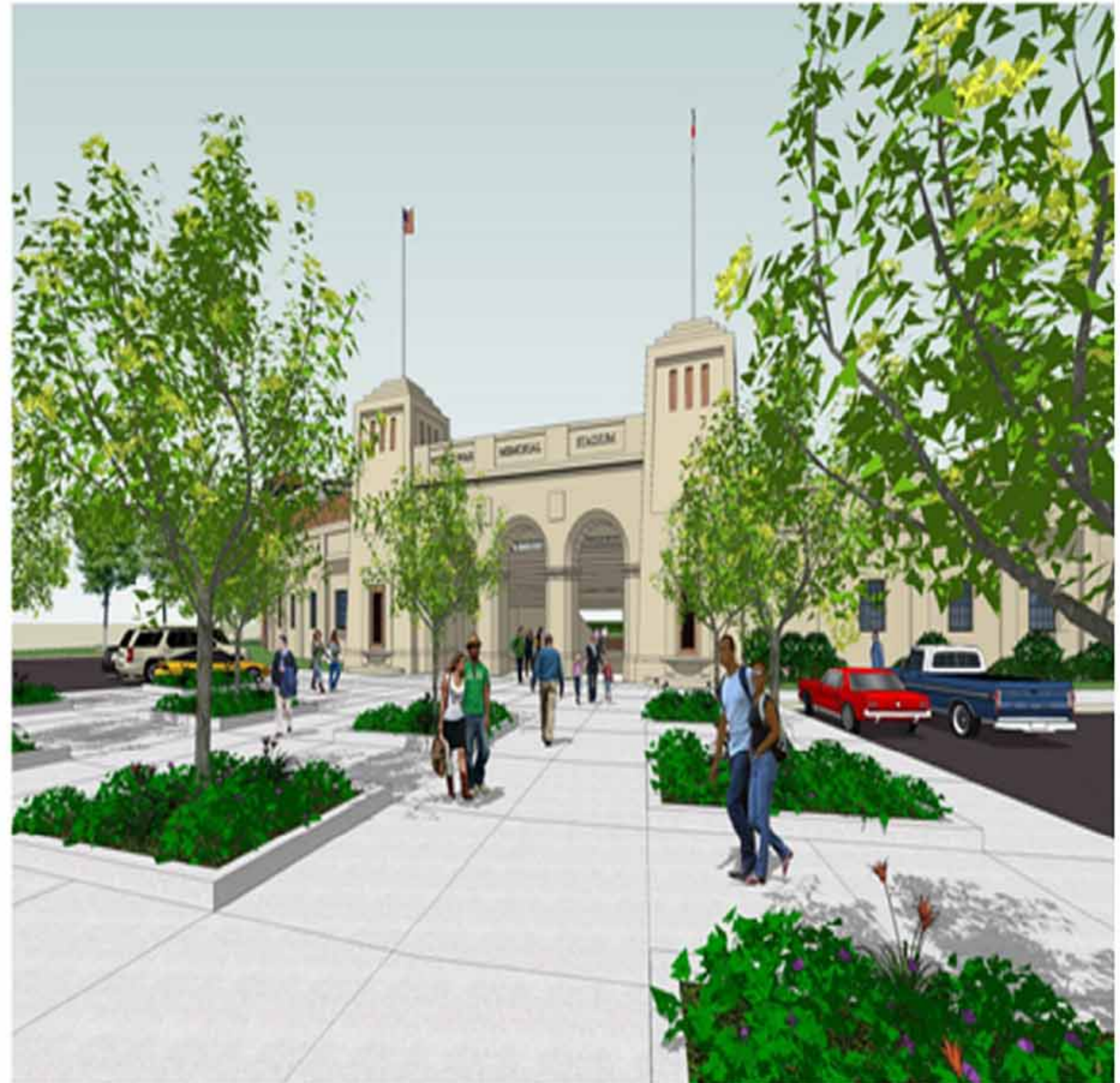
ARTIST CONCEPT OF RESTORED STADIUM